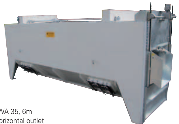
SPRUWA 35, 6m with horizontal outlet